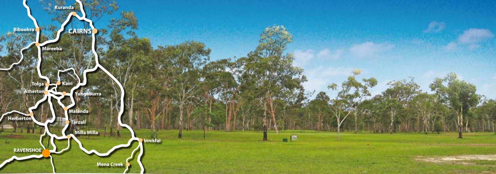
Sunrise Estate Subdivision Plan